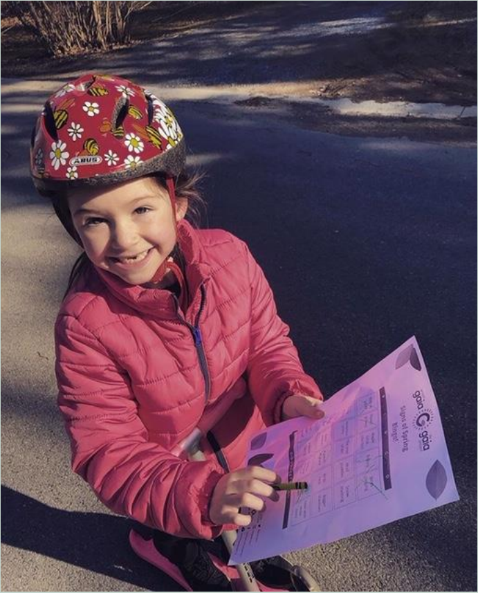
Climate change learning heads outdoors with the Gaia Project.