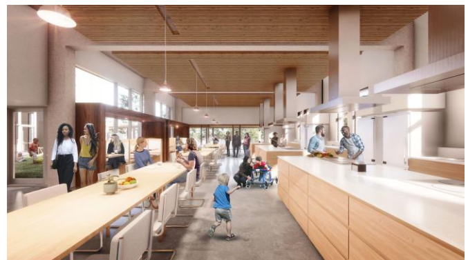
Renderings of the new Ronald McDonald House providing a home-away-from home for Atlantic Canadian families with hospitalized children.