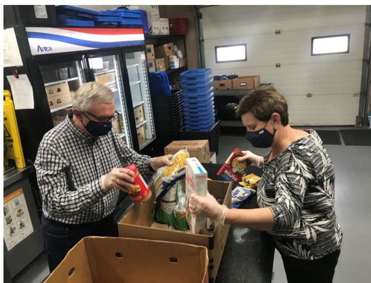
Lethbridge Food Bank volunteers pack up hampers to deliver to community members during COVID lockdown.

In partnership with McCain Foods, the Foundation also continued its support of the McCain Kids' Table program delivering breakfast programs to 24 schools. This fall, we reached out to each school to ensure that programs continue to have the resources to ensure that no child goes to school hungry.