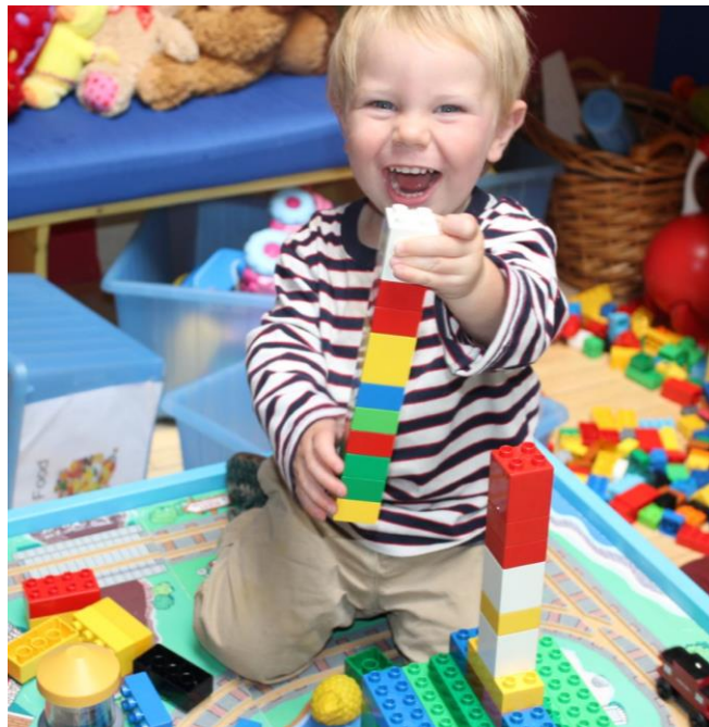
All smiles at Ronald McDonald House, Atlantic