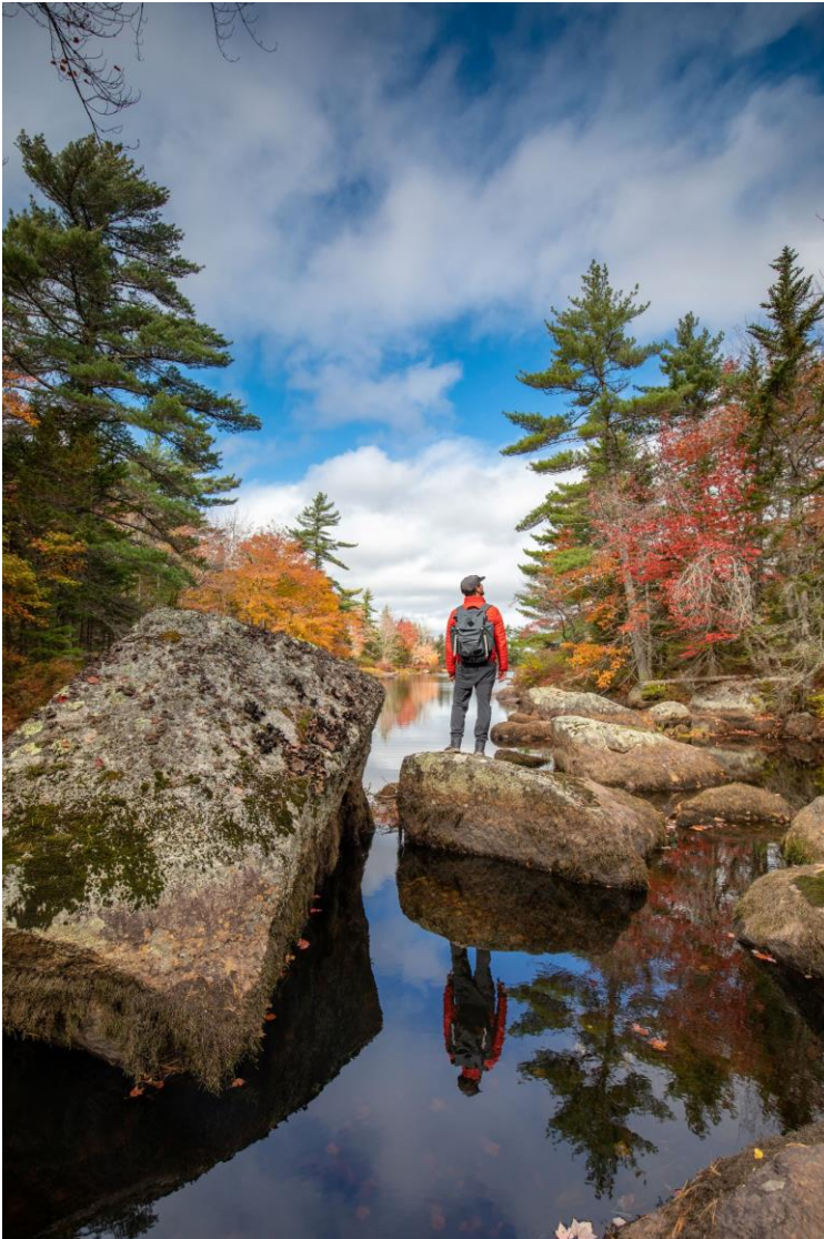
The Blue Mountain Wilderness Connector, conserved land in Nova Scotia protected by NS Nature Trust volunteers.

The urgency of climate change and the need to protect our natural environments have been brought to light in the global pandemic. Now, more than ever, nature provides us with space to heal, renew and connect when we must maintain social distance. The Canadian government has set ambitious targets to preserve natural lands in all provinces. In the Maritimes, where provinces are small, achieving conservation objectives is not possible without engaging volunteers and private landowners. In PEI, for example, 90% of lands are privately owned.