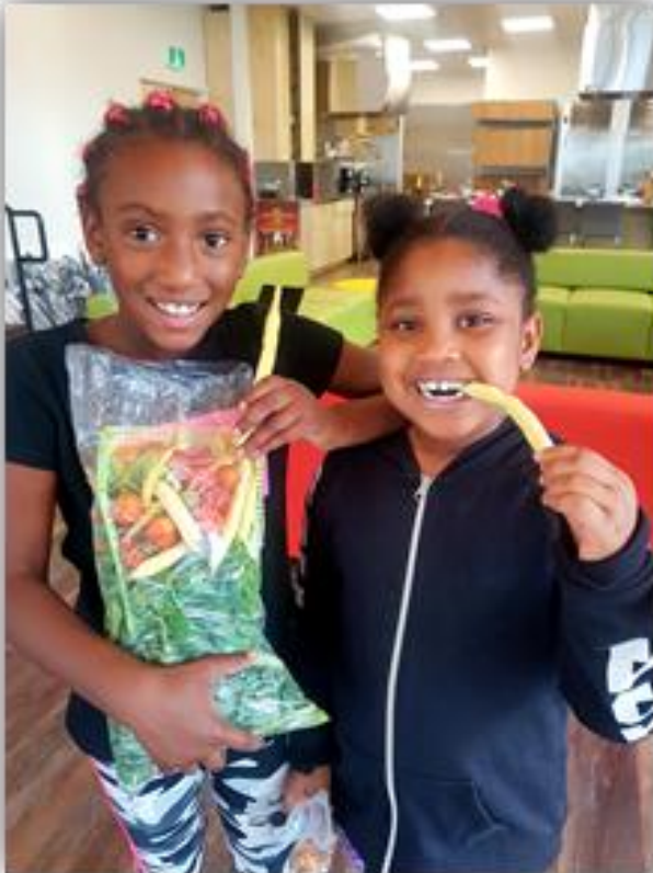
Hope Blooms youth harvesting produce from the community garden.

The Gaia Project moved their in-school Trash Tracker and Climate Quest programs to an online platform in early spring. Over five weeks, 795 families participated in weekly online projects throughout the lockdown period. Their online program has now been made available to all K-12 schools in New Brunswick.